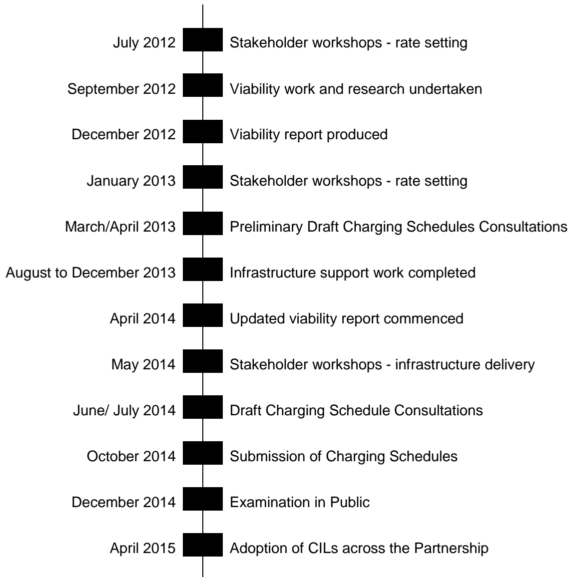
Figure 2: Project Programme.

9.1 Figure 2 outlines the proposed project programme timeline for the CILs across West Northamptonshire.